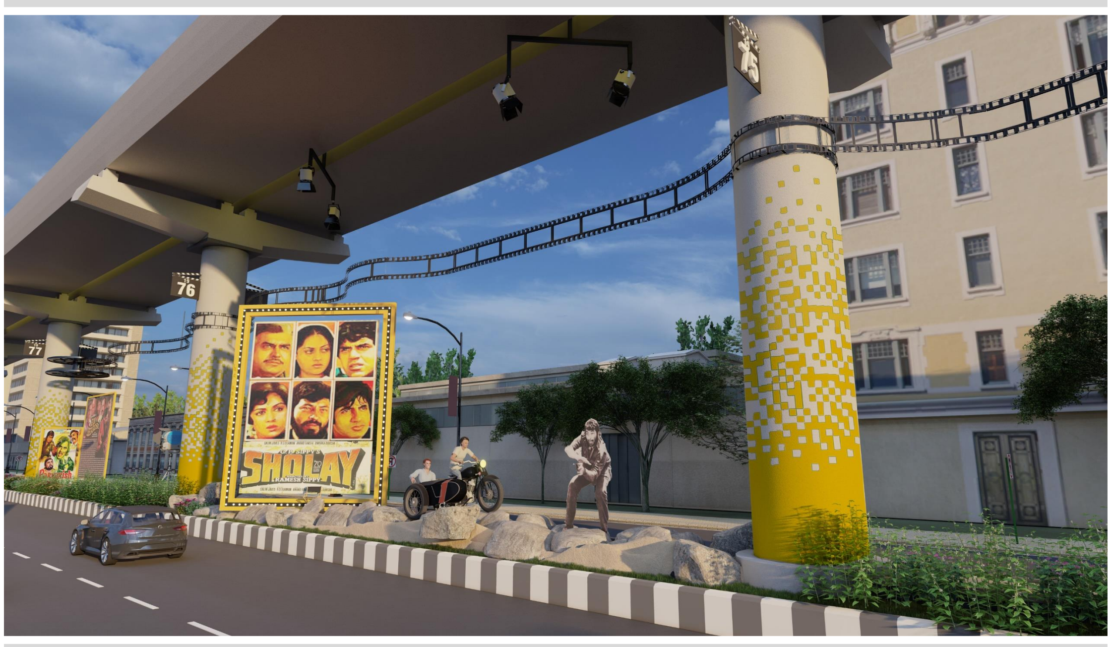
*Digital content is not included within the scope of work. Copyrights goes to respective production houses.